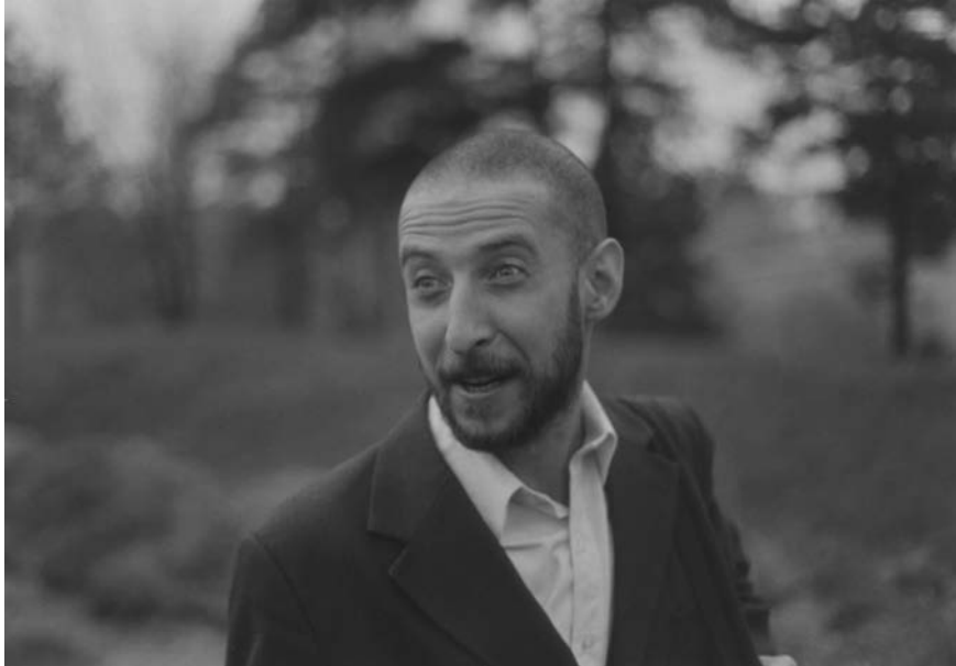
Alexander Brodsky © private