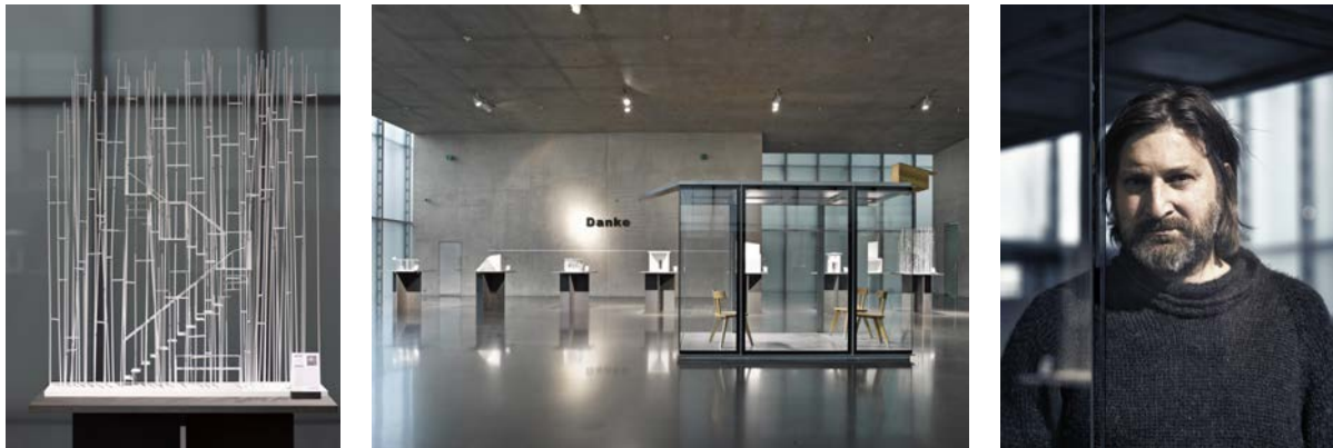
From left to right: Sou Fujimotos design for BUS:STOP © Adolf Bereuter; Presentation of the models and the finished BUS:STOP at the Kunsthaus Bregenz © Adolf Bereuter; Chilean architect Smiljan Radic © Adolf Bereuter