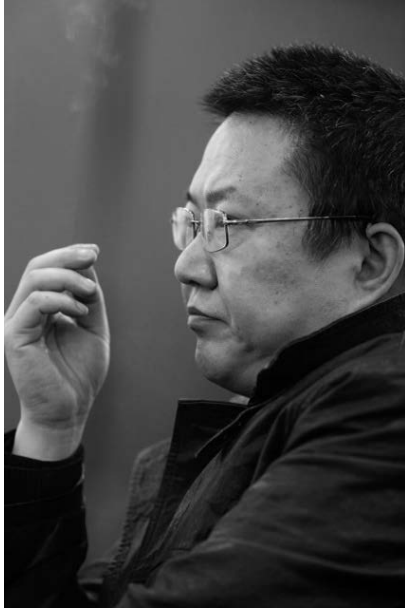
Amateur Architecture Studio